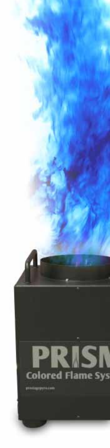
Prism2 Operators Manual